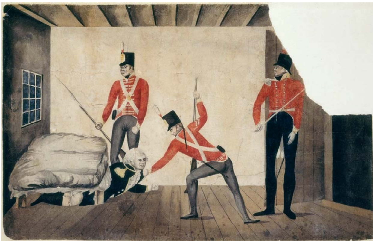
Source 1: The arrest of Governor Bligh, 1808. This picture is the first Australian political cartoon.

The artist is unidentified but is suspected to have a connection with the NSW Corps. Bligh is depicted in this particular way to convince the wider public that he was not of gentlemanly status and thus unfit to govern. This picture is the first known Australian political cartoon.